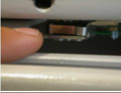
DSCN1000 is a picture of the lower left door switch S657