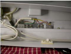
DSCN0997 is a picture looking down both upper switches with the cover removed