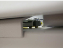
DSCN0995 is a picture of the upper right door switch S660