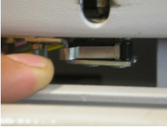
DSCN0999 is a picture of the lower right door switch S659